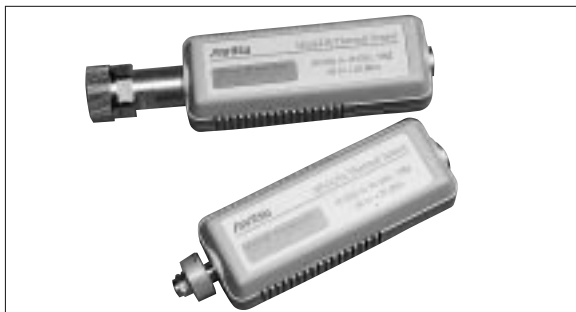
New power sensor technology achieves industry leading measurement linearity and high sensitivity.

The 90 dB range MA2470A Series Power Sensors' high sensitivity reaches stable power readings to -70 dBm. 35 kHz sample rates profile cellular, PCS and other pulsed signals to 0.1 \mu sec resolution. Modern connector technology achieves industry leading return loss for improved accuracy through 50 GHz. The 87 dB range MA2440A Series High Accuracy Sensors further improve return loss performance by adding a matching circuit to the MA2470A Series' front