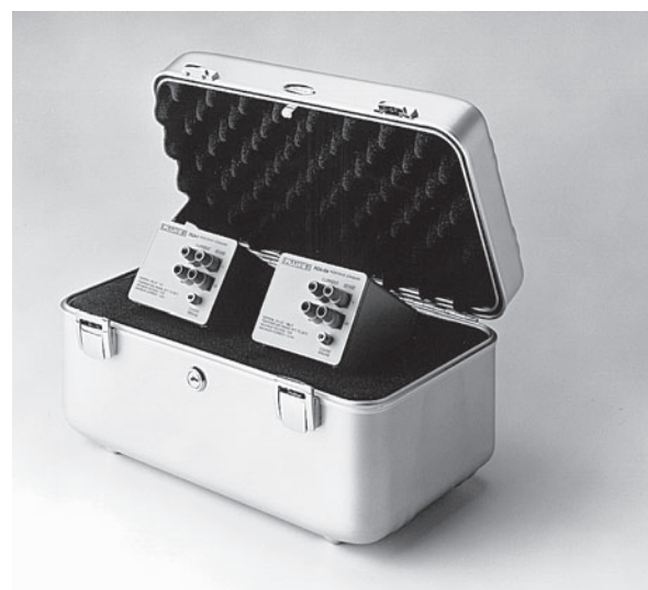
Optional 742A-7002 transit case

Fluke. Keeping your world up and running.