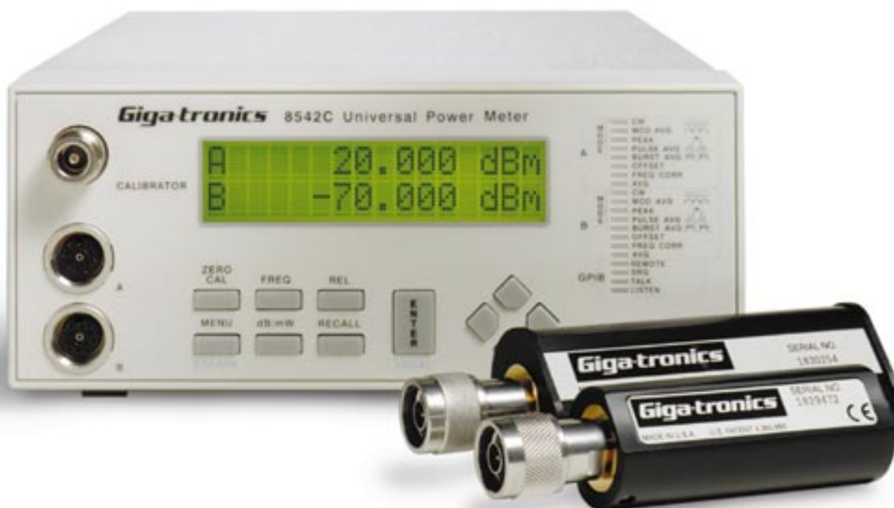
The Giga-tronics 8540C Series combines the speed, range, and capabilities needed to test today's sophisticated communications systems.

The exclusive Time Gating feature of the 8540C lets you program a measurement start time and duration to measure the average power during a specific time slot of a burst signal. This is critical for accurately measuring the average power of GSM, NADC and